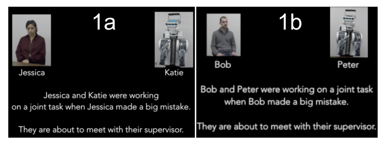
Fig. 1: The opening screens for the female robot (a) and male robot (b) conditions.