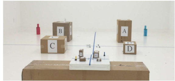
Figure 1: Instructors manipulate a miniature diorama (foreground) to a desired configuration, then command the instructee, who is either human or a robot, to move objects in the larger diorama environment (background) to match. During the task, the instructee cannot directly observe the miniature diorama.

derstand the properties of human instruction-giving that robots will need to process.