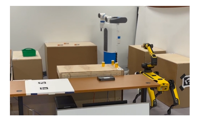
Figure 2: A scene from the demonstration.

four phases below in detail, showing how the four central architectural components—the DM, GSM, SLIK, and MTP—work together to enable the problem solving dialogue interactions. A video of the demonstration can be found at: https://youtu.be/_PJIkCyULjQ. The source code used to execute this demonstration can be found at: https://github.com/mscheutz/diarc.