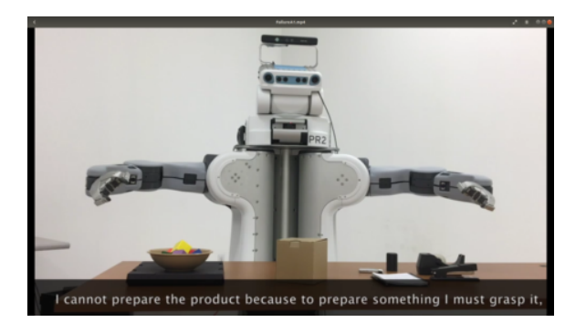
Figure 2: Screen Capture from Example Video with Generated Text. A robot, given an instruction, explains an action failure.

robot, (5) I would have the robot's vision sensors repaired, where 3 is the correct solution.