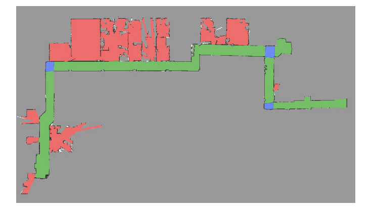
Figure 4: Metric-topological map of the demonstration environment. This 44m x 75m map was produced by running Vulcan's metric SLAM and place classification algorithms on sensor data of the wheelchair being manually driven through an environment. Color indicates the "type" of each region in the topological map: decision points are blue, path segments are green, and destinations are red.

In this paper, we make three primary contributions. First, we demonstrated how the integration of the Vulcan and DI-ARC architectures produces a hybrid architecture with not only the capabilities of both architectures, but new synergistic capabilities as well: by leveraging Vulcan, DIARC can navigate through environments, Vulcan can initiate actions based on flexible natural language requests, and as a whole, Vulcan-DIARC can now travel to previously unknown objects that are learned about in one-shot through natural language, a capability previously held by neither architecture.