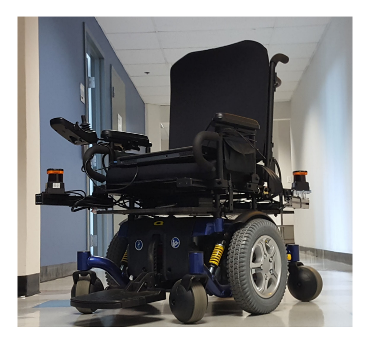
Figure 1: The Vulcan Intelligent Wheelchair

what is brought to the table by both Vulcan and DIARC, but because they promise to be of great benefit to society. Within the United States alone, there are at least 3.6 million wheelchair users, 40% of whom find it difficult or impossible to control a wheelchair using a joystick [7, 12]. To make wheelchairs more accessible, many researchers are turning to Natural Language (NL) as a control modality. While such NL-enabled wheelchairs have existed for nearly forty years (e.g., [10]), even many of the most recently presented NLenabled wheelchairs have only limited capabilities, e.g., the ability to be commanded to go forward, left, right, backwards and to stop [2, 3, 6, 19, 20, 22, 23, 31, 32, 34, 38, 40, 39, 44, 45]. There have, however, been a small number of recent wheelchairs also capable of following walls [30], entering elevators [25], traveling to nearby objects [14], or traveling to named objects and locations [13, 24, 26, 29, 33, 42].